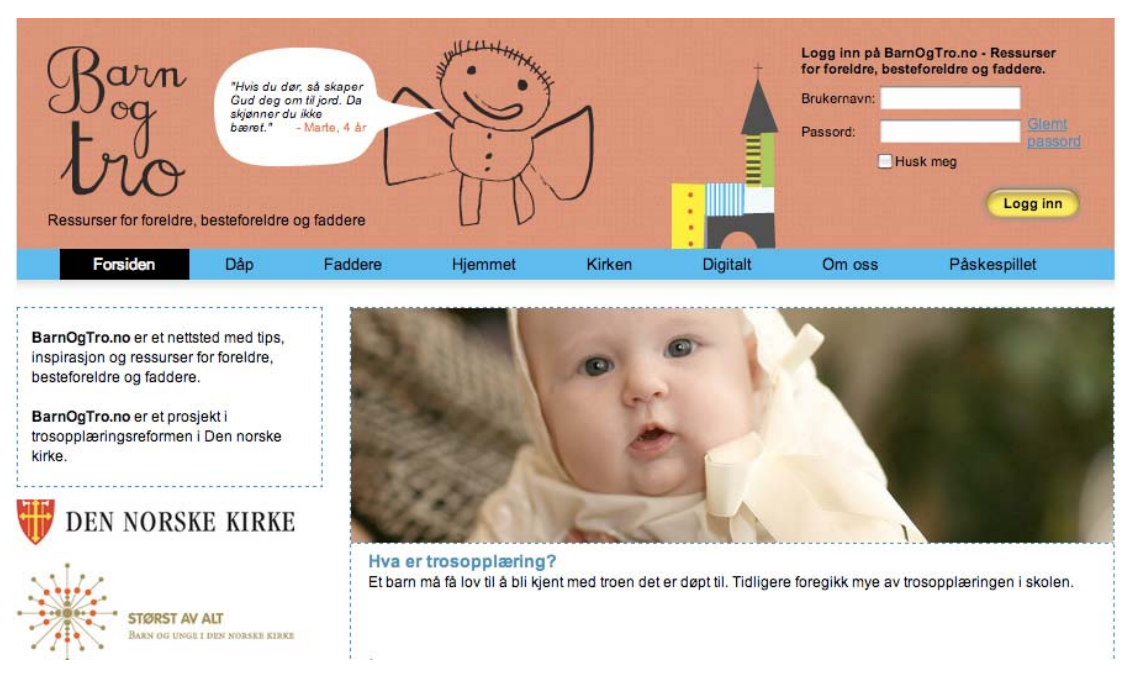
Figure 3. The top of the front page at <u>BarnOgTro.no</u> [22 November 2011] where parents, grandparents and godparents could log in for further resources in the religious education.

Following the five years of developments and trials at the local base, the responsibility was transferred to the national council of the Church of Norway. The activity ceased, as there was no maintenance of the site. The plan is to re-launch BarnOgTro.no as a national resource centre.