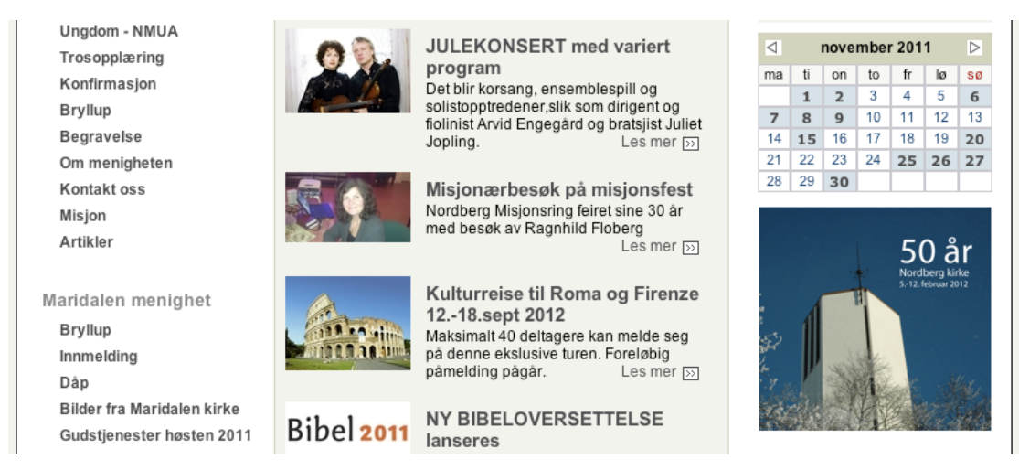
Figure 4. From the home page of <u>www.nordbergmenighet.no</u> featuring the 50 years of their church, a Christmas concert with varied programme, visit of a missionary, a tour to Rome and Florence organized by the congregation, as well as information on the new translation of the Bible into Norwegian. [21 November 2011].

Nordberg menighet , geographically within a suburban middle class area of Oslo, is selected as the local congregation ('menighet') in this research as it was the original home to the BarnOgTro website in case 2, thus inviting direct comparisons of online and offline activities based in the same church. The parish of Nordberg also has a good web presence of its regular offline activities <u>www.nordbergmenighet.no</u> and has leaders who are used to media work. Hence, it gives meaning to see Nordberg parish alongside the online Church of Norway activities in this study.<sup>9</sup>