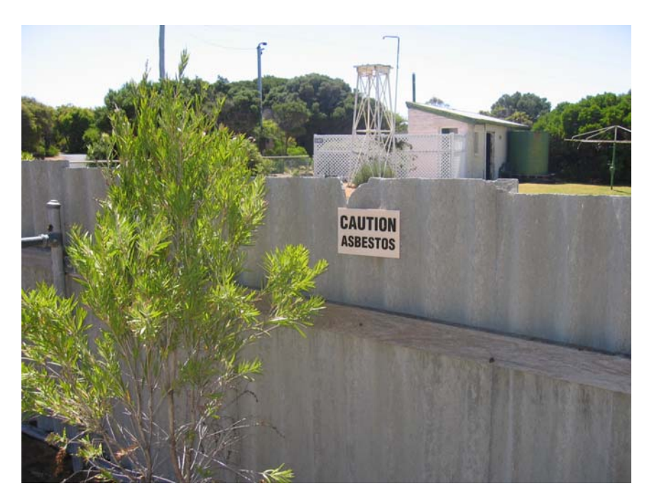
Asbestos fence, Western Australia

The researchers were Chief Investigators (CIs) on an Australian National Health and Medical Research Council (NHMRC) funded project called 'Community consequences of asbestos exposure in Western Australia'. The multi-disciplinary project ran from 2007 to 2009 comprising researchers in public health, epidemiology, medicine, history and journalism from three universities in Western Australia. The journalism component of this asbestos research project was to develop a website called Asbestos Stories featuring audio interviews with people affected by asbestos. A further tranche of funding from 2010-2012 is allowing the researchers to experiment with the community-building capacity of the website which will be launched in November 2010 as the Australian Asbestos Network with Asbestos Stories as one component. The multidisciplinary collaboration has given journalists access to authoritative historical, medical and public health resources, while experts in those fields have been able to access journalistic expertise to experiment with new and original ways of engaging with a wider public.