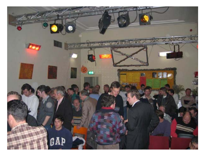
Fig. 2 Wireless Leiden community: coffee break during meeting in local community centre (Leiden, 2 November 2003).