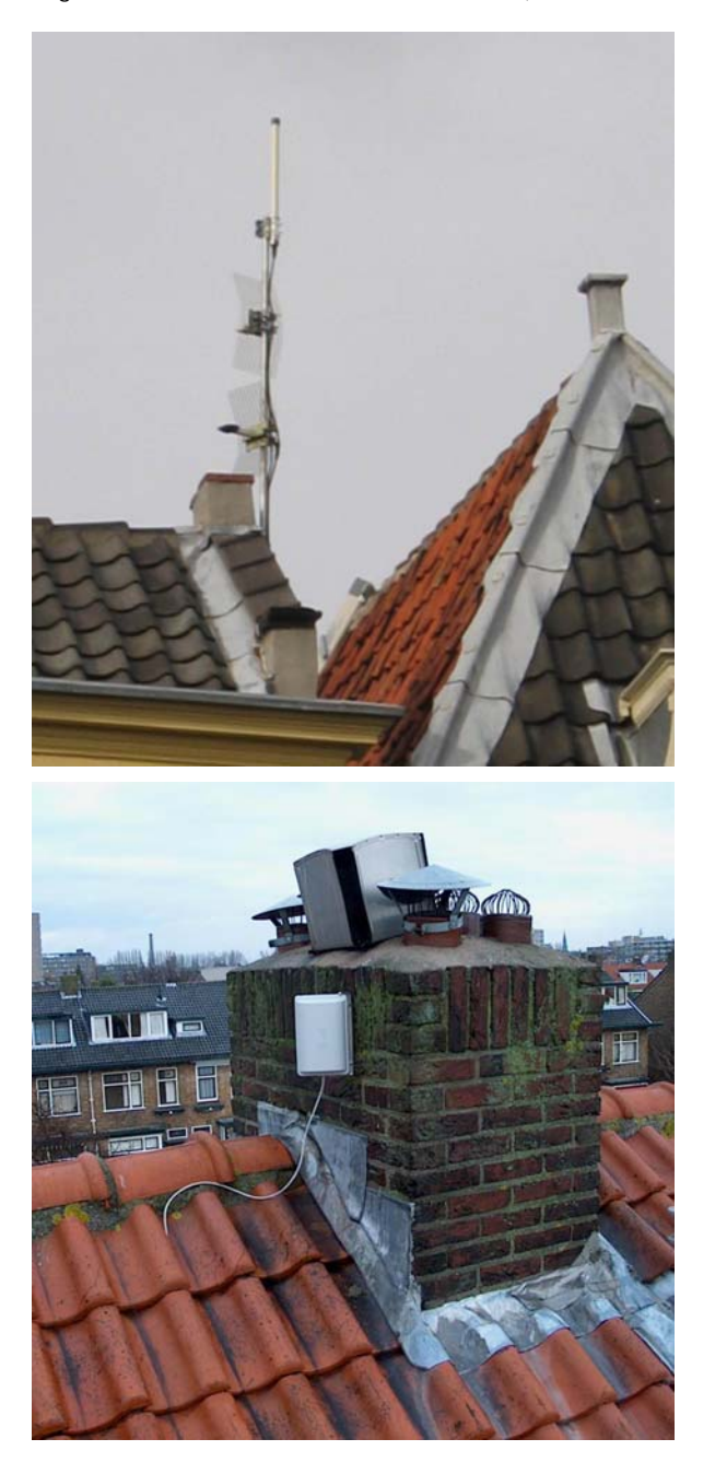
Fig. 3 On top a 'volunteer' node with two long-range directional at the base and one omni antenna on top; below a 'user' node consisting of a commercial Wandy client-device. Note the differences in the size and complexity of the Wi-Fi configuration to connect to Wireless Leiden. (source: website WL, 2007).